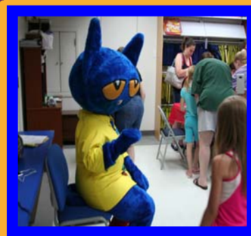
Children's Department~ Pete the Cat