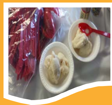
Teen Department ~ Ice Cream