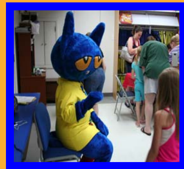
Children's Department~ Pete the Cat