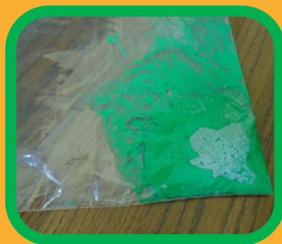
Teen Department ~ Slime